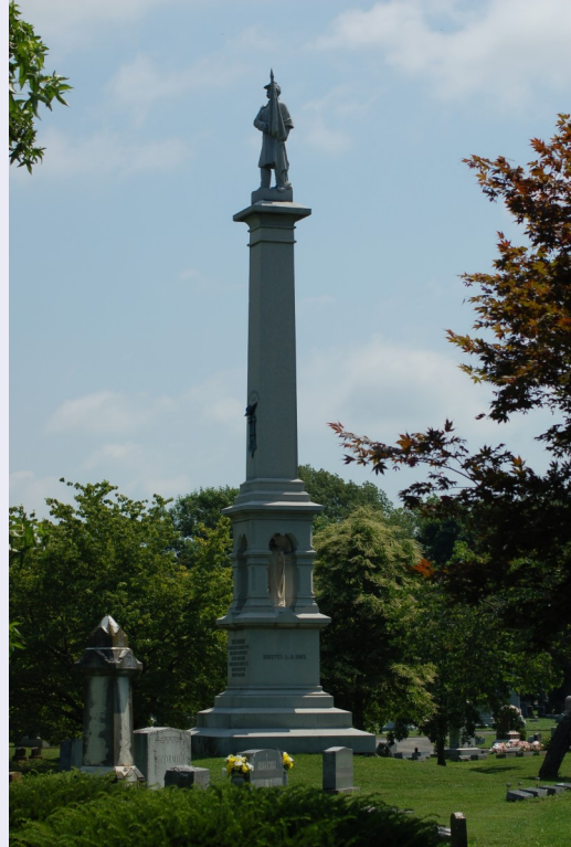
Maysville, Ky, G.A.R. monument.